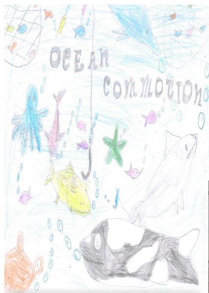
Programme designed by Gwennie 4F