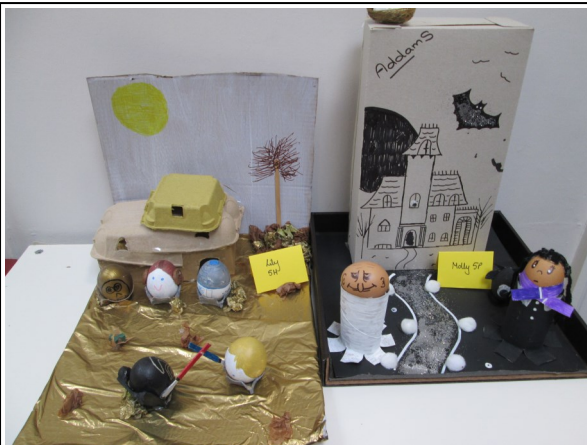
Y5 winning eggs: Lily from 5H Molly from 5P