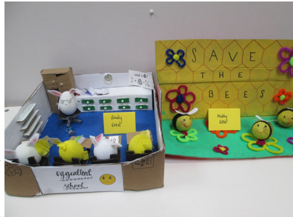
Y6 winning eggs: Emily from 6MH Molly from 6HW